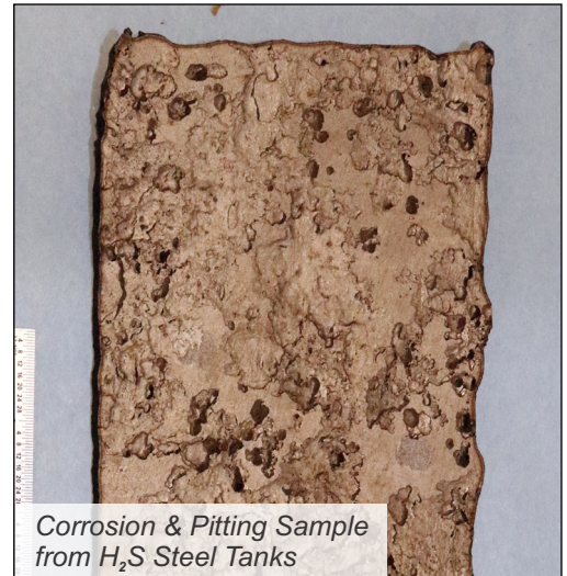
Corrosion & Pitting Sample from H 2 S Steel Tanks

ESi also evaluated the design of the tube heat exchanger with alternative metals of carbon steel shells and stainless steel tubes as its composition was alleged to be the cause of the leakage. However, the original heat exchanger's construction is commonly used within the process heat transfer industry and is a recognized and generally accepted method of construction within the ASME BPVC.