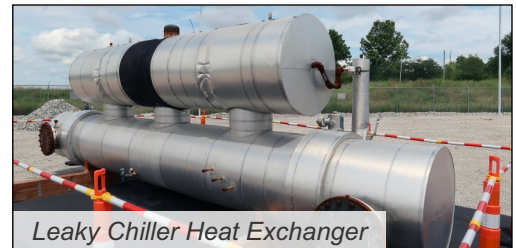
Leaky Chiller Heat Exchanger